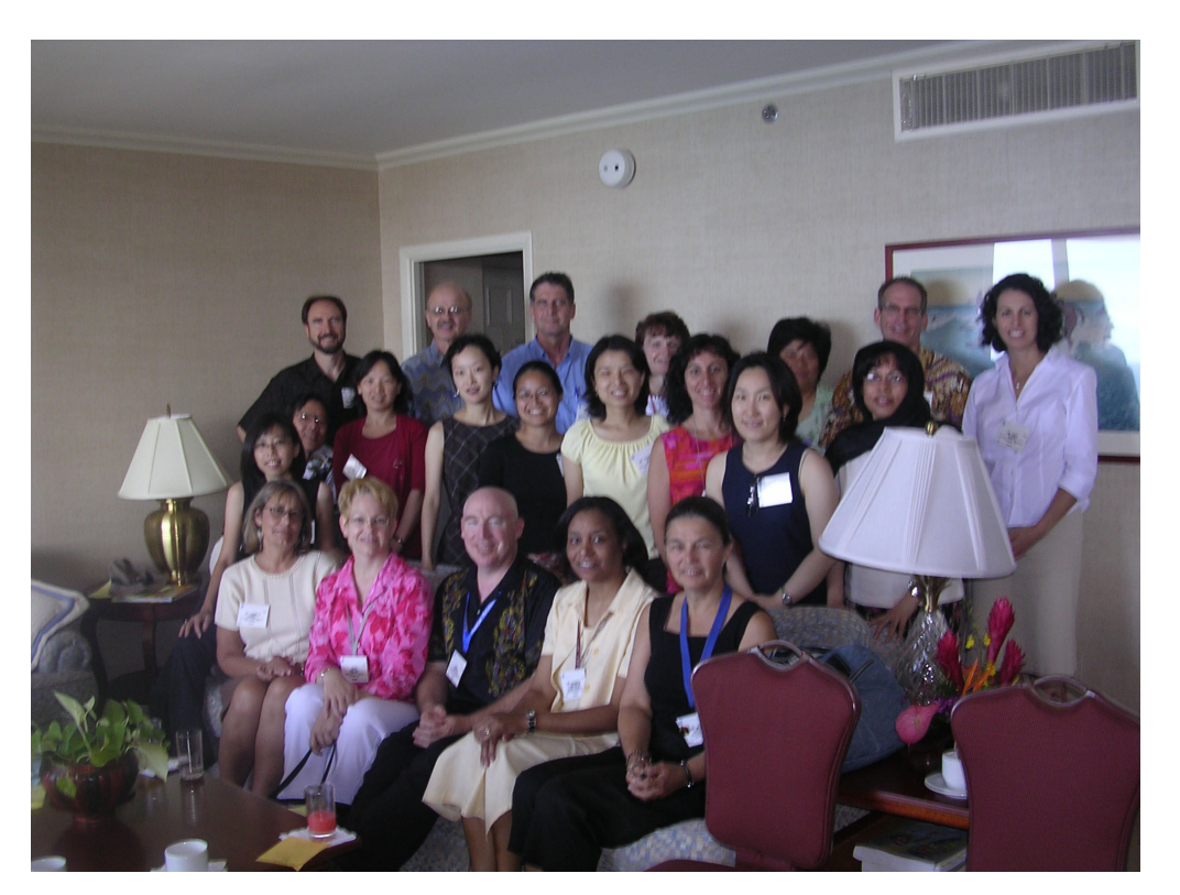
International Scholars' Meeting in the Hospitality Suite at the 2004 APA Convention.