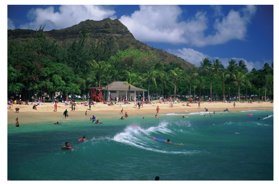
Reminder: During this year's Convention in Honolulu, all substantive APA programming will end at 2 p.m. However, Division 17 will hold programming meetings (business, awards ceremonies, social hours, etc.) after 2 p.m. until early evening.