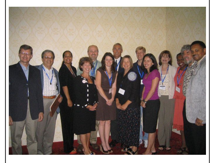
Congratulations to all!