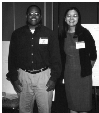
Student poster presenters at the Sections Social Hour

significantly contributed to their professional development, and that students definitely wanted to see the program repeated at next