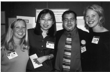
Student poster presenters at the Sections Social Hour

Two of these programs proved to be very successful this year. The Roundtable for Sections, focusing on the theme of "Asking the Expert," was well attended and feedback about the program was positive, indicating that it met its objectives of fostering discussion between young professionals and more senior members