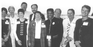
Division 17 Executive Board