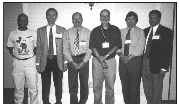
The Division 17 2001 Fellows are: (left to right)