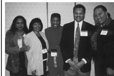
After the Division 17 Business Meeting